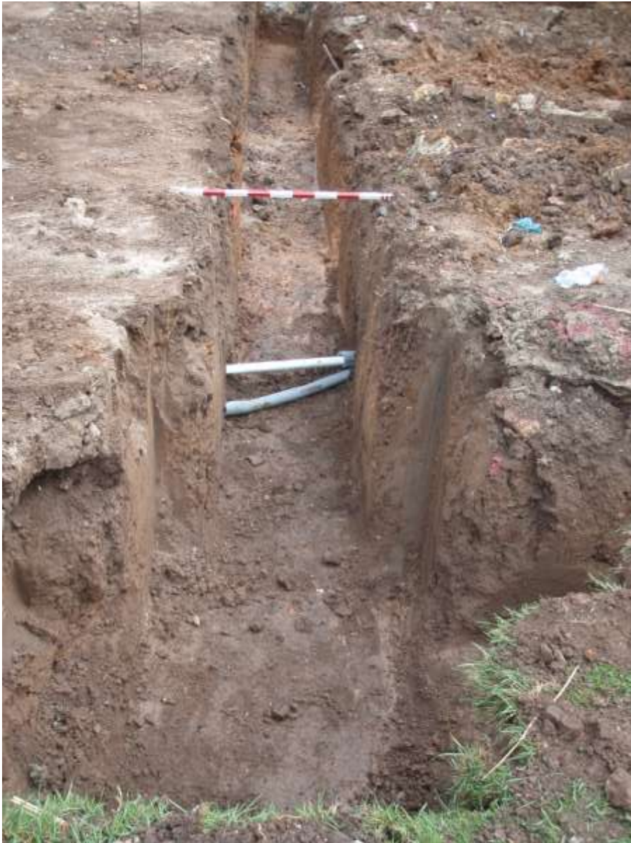
Plate 6. View of foundation trenches (looking N)