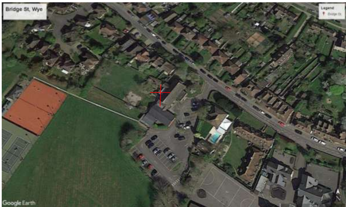
Plate 1. Aerial view of site (red target) showing the site prior to development.

(Google Earth 20/4/2015: Eye altitude 569m).