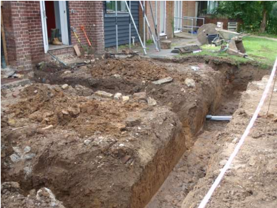
Plate 2. General view of site (looking SE)