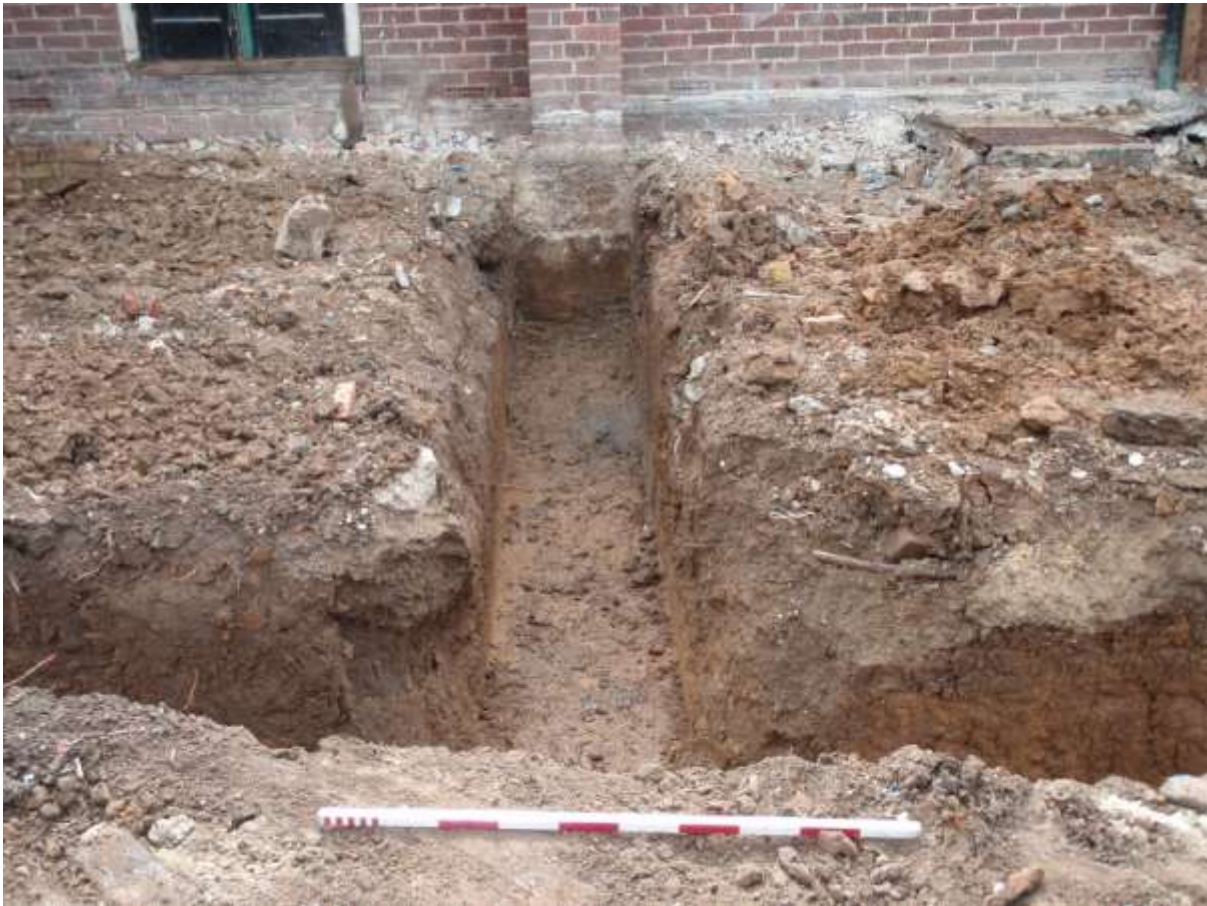
Plates 4, 5. View of foundation trenches (looking east)